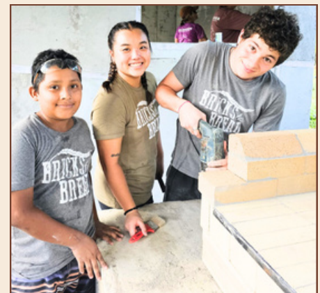
Youth Building Oven #15