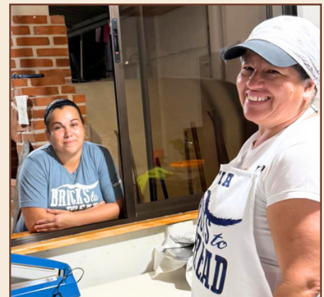
Women of San Jerónimo, Oven #21